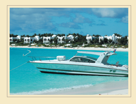
A member of The Leading Small Hotels of the World

500 Top Hotels in the World 2004 Travel & Leisure